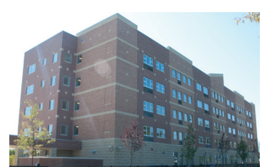
Enola A. Dew Apartments