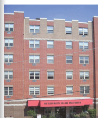
Elois McCoy Building